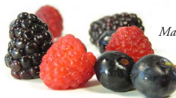
Maturitas. June 9, 2009.

Future research will help us understand more clearly the role that specific foods and dietary supplements play in brain health and overall health.