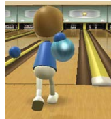
Wii Bowling